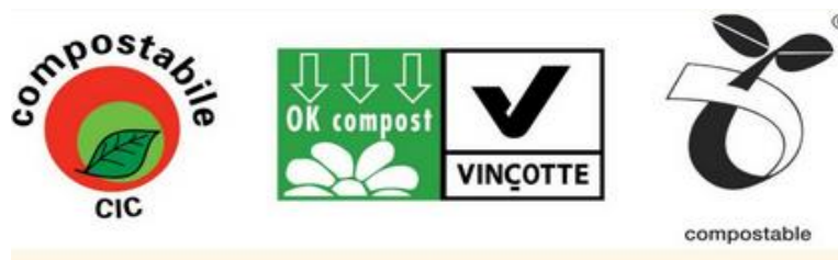
A few compostable bag labels: Italian CIC, Belgian Vincotte, German DIN

The EN 13432 standard specifies that packaging may be deemed to be compostable only if all the constituents and components of the packaging are compostable. Hence, all components must be tested. Compostable materials have to be labelled with specific logos, which guarantee that they are certified according to the compostability standard. A neutral competent third party has validated the conformity and guaranteed the monitoring of the product on the market.